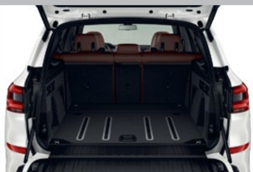
Luggage-compartment package with automated sliding and anti-slip rail, flex net and electric rolling cover with stowage in floor insert

Please refer to this insert for local market specifications.