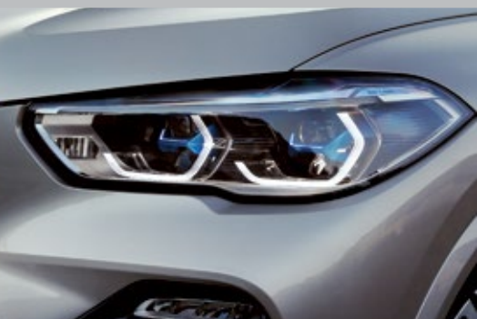
Adaptive LED headlights with BMW Laserlight incl. BMW Selective Beam

*Actual car specifications may vary from the picture shown above. Details for the options available, please speak to your authorized BMW dealer.