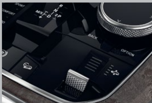
Adaptive 2-axle air suspension with automatic self-levelling suspension, selectable on five levels in total of 80mm adjustment travel