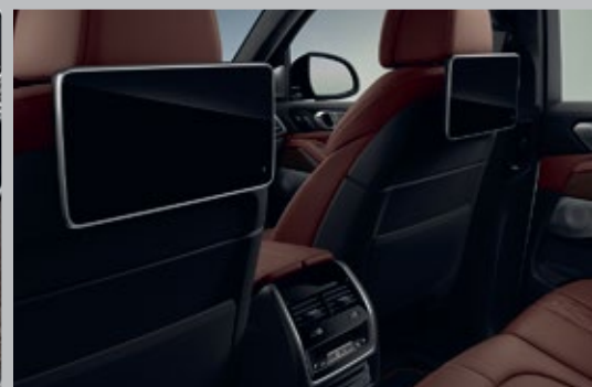
Rear-seat entertainment Professional, 2 tiltable, independent 10.2" touch screens with BluRay drive and HDMI connection