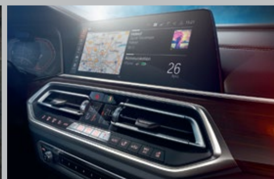
BMW Live Cockpit Professional